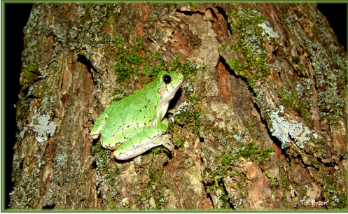
Tree Frog